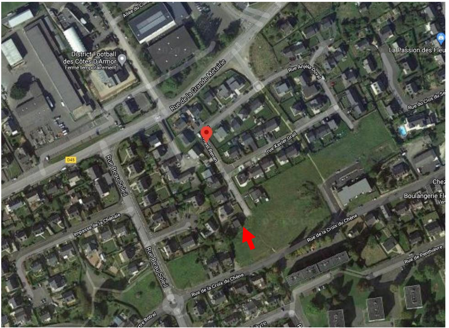
Plan de situation 3